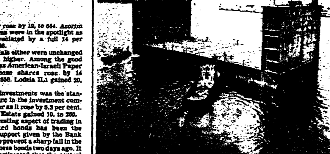
TUGBOATS NUDGE along one of the three sections of a floating dock launched into Haifa Bay by Israeli Shipyards this week.